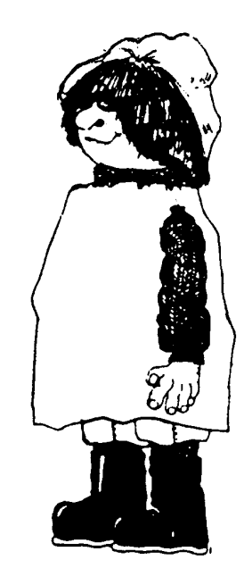
Emergency Rain Gear

Emergency Rain Gear - No matter how much you emphasize the importance of proper clothing there will always be a number of students and assistants who will show up poorly dressed. It is a good idea to bring along a dozen or so large plastic garbage bags. These bags are great because they can be fashioned into make-shift rain coats, hats, and boots. And get clear bags; they can be used as aquariums or as aids to writing during rainy weather.